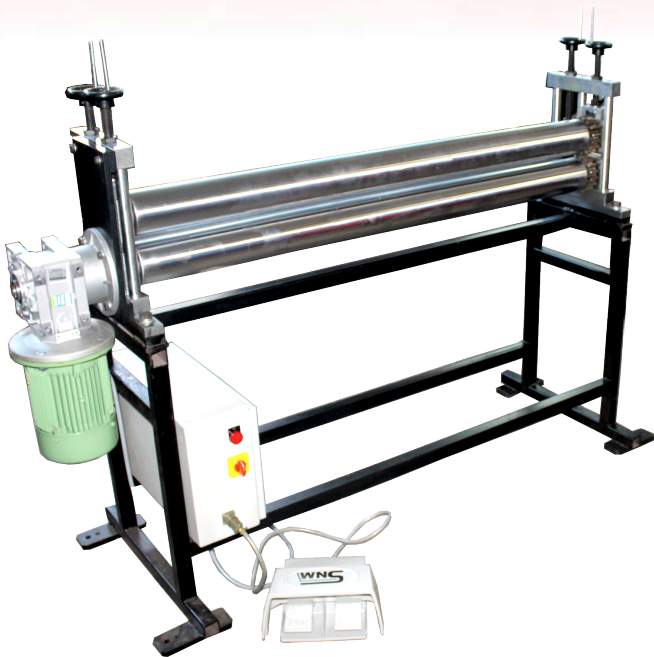
POWER BENDING ROLLS Model PBR 1250